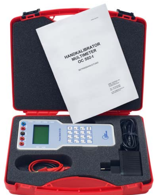
OC 502-t with accessory

Built-in rechargeable battery permits 9 hours of operation with the output current of 20mA and the backlight switched off.